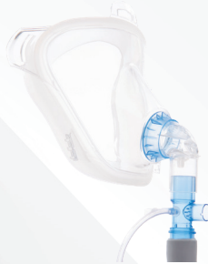
Total Face Masks