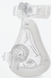
Full Face Masks

Engineered for comfort and effective sleep apnea therapy, our CPAP masks provide a secure seal and minimal leakage for consistent positive airway pressure. Available in nasal, full-face, and nasal pillow designs to suit individual preferences and sleep styles. Made from soft, skin-friendly materials with adjustable headgear for a customized fit. Compatible with all standard CPAP machines.