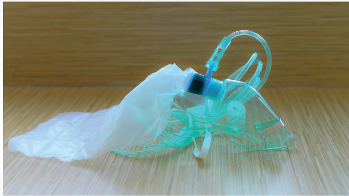
Oxygen Mask with reservoir

Comfortable, durable, and designed for optimal oxygen delivery, our oxygen masks are ideal for medical, emergency, and therapeutic use. Made from high-quality, latex-free materials, they feature adjustable straps and a contoured design to ensure a secure and comfortable fit for patients of all ages. Available in adult and pediatric sizes, with or without reservoirs.